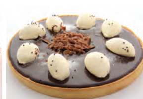
Chocolate / Nutella 5 days shelf life, chilled