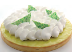
Lime / ginger 3 days shelf life, chilled