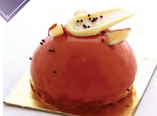
Mango Custard with Salted Caramel

Dark chocolate mousse with passion fruit jelly, almond dacquoise sponge. 5 days shelf life, Chilled