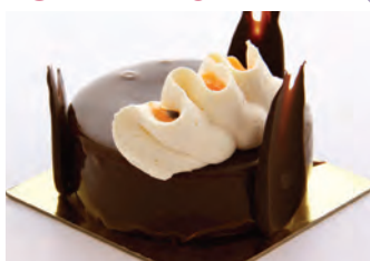
Dark Chocolate & Passion fruit:

Dark chocolate mousse with passion fruit jelly, almond dacquoise sponge. 5 days shelf life, Chilled