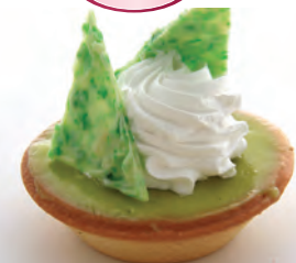
Lime / ginger Meringue

Smooth and freshening Lemon curd, choco crunch. 3 days shelf life, chilled