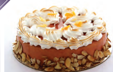
Mango custard & Salted Caramel

Small 18cm / Medium 24cm 5 days shelf life, Chilled