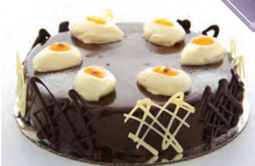
Dark Chocolate & Passion Fruit:

Small 18cm / Medium 24cm 5 days shelf life, Chilled