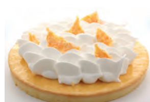
Lemon Meringue 3 days shelf life, chilled