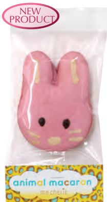
Pink Rabbit Raspberry flavour

1box of 12 bags, 10 days shelf life, ambient. 1box of 12 loose, 7 days shelf life, Chilled.