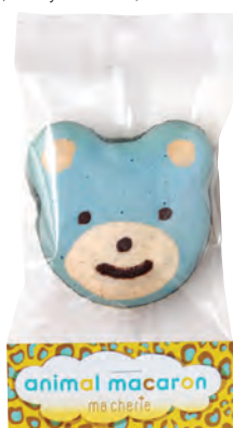
Teddy bear mix berry flavour