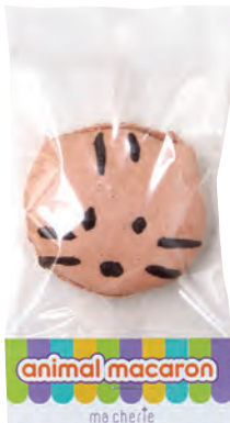
Kitty cat Nutella flavour