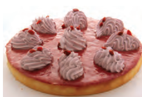
Raspberry 3 days shelf life, chilled