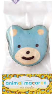
Teddy bear mix berry flavour

2 Macaron Box 8 days shelf life, ambient Orders: Minimum 10 units.