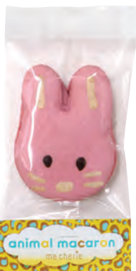
Pink Rabbit Raspberry flavour