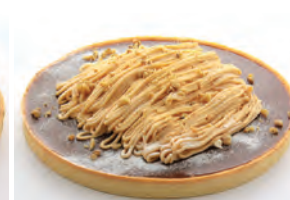
Salted Caramel 5 days shelf life, chilled