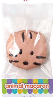
Kitty cat Nutella flavo